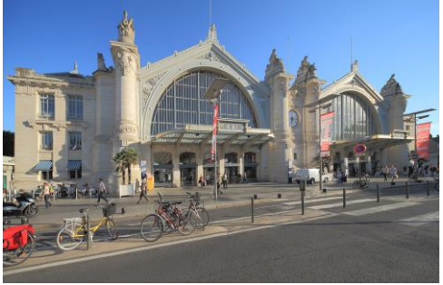
Tours central train station